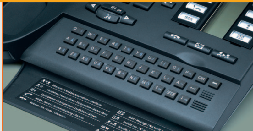
▲ Alphabetical keyboard

The Alcatel Premium and Advanced Reflexes™ are equipped with an alphabetic keyboard. This device allows access to the "call by name" company directory and to "text mini-messaging" services.