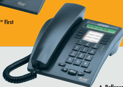
▲ Reflexes™ Easy