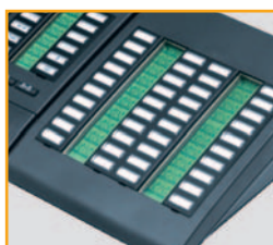
▲ 20 or 40-key versions