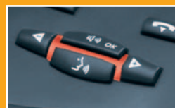
▲ Audio control keys

Audio control functions (loudspeaker volume control, hands-free audio control, mute, etc) are separated from the system's function keys to facilitate easy and clear audio control for the user.