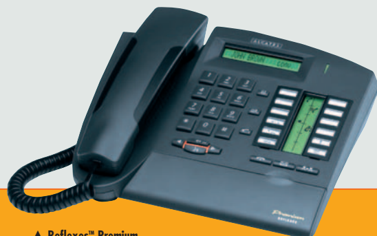
▲ Reflexes™ Premium