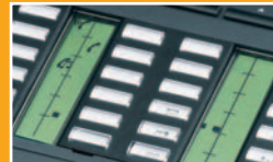
▲ Labels you can customize. Large transparent key tops

Programmable system or user keys are available on the Alcatel Reflexes™. Labeling can be standardized at a corporate level and/or user-defined. Determining the status of a call is simple with the help of easy-to-understand icons that replace the confusing sequences of LED combinations. The label associated with each key is easy to read because the key top is equipped with a built-in lens that magnifies the key label. This key top is a patented Alcatel feature.